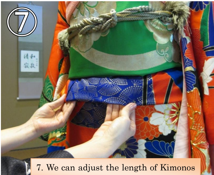
7. We can adjust the length of Kimonos by tucking down this OHASHORI part.