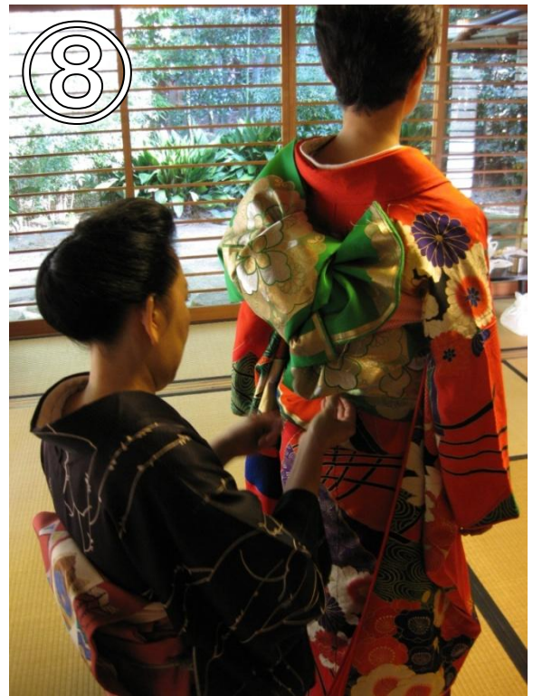
8. The finishing touches