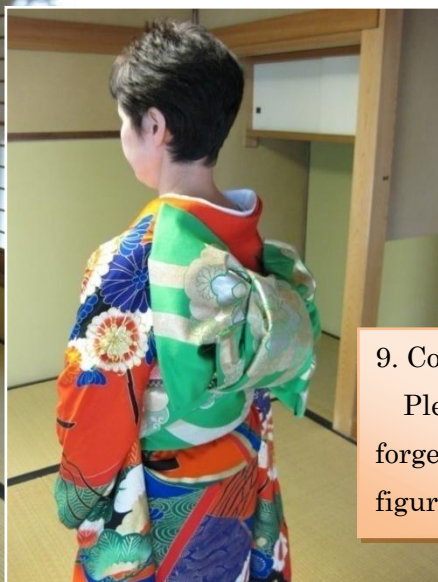
9. Completed !

Please take pictures. Don't forget the beautiful back figure, too.