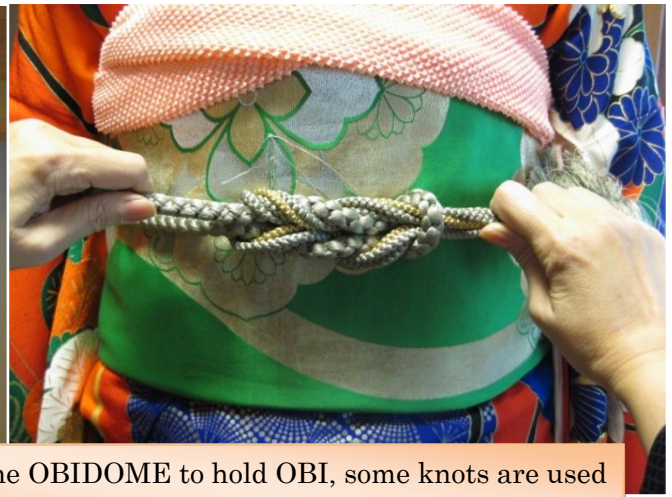
6. Tie the OBIDOME to hold OBI, some knots are used depending on the wearers age and or occasion.