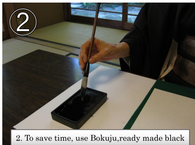
2. To save time, use Bokuju, ready made black ink instead of the rubbing ink stick.