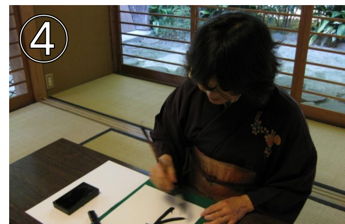
4. Don't hesitate, draw your own original kanji and your name in Japanese