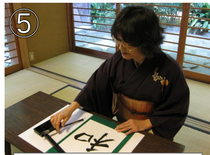
5. After some practice complete your masterpiece.