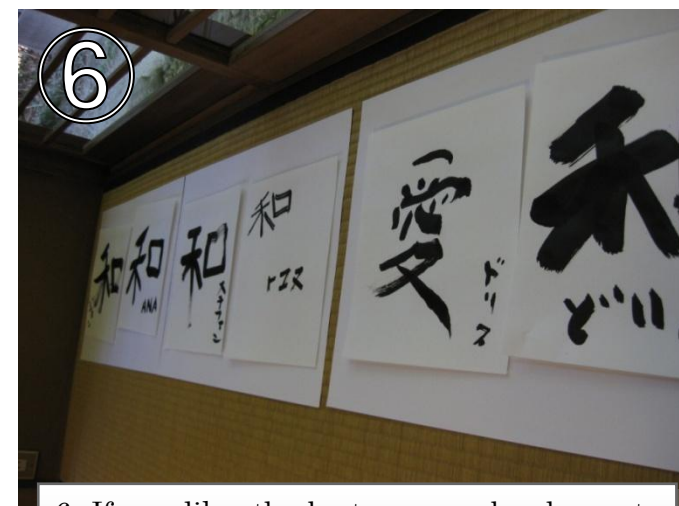
6. If you like, the best one can be chosen to receive a prize. We can prepare small gifts for the winner.